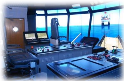
NOTI Dynamic Positioning Simulator

Academic Partners with NUSI Offshore Training Institute (NOTI, Panvel) and Mohamed Ebrahim Serang Centre (MESC, Valsad)