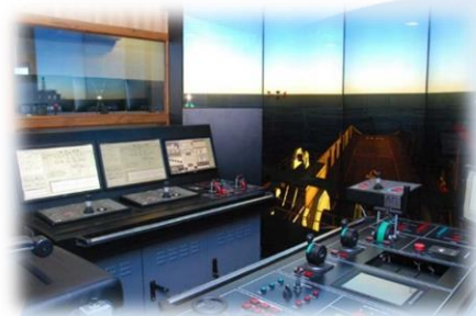
NOTI Bridge Simulator

NOTI and MESC. ISF also assists in procurement of training aids and by continual support through monitoring processes and tracking.