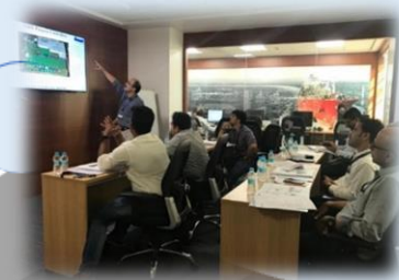
Training at the Scorpio Unit

In 2017, ISF Group collaborated with Scorpio Marine Management as academic/training partners. ISF Group has assisted to setup an inhouse training facility for training engineering staff on ME engines, Electrical, Electronics and Automation and Controls.