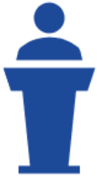
Key Note Sessions from Industry Experts