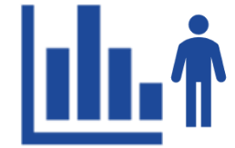
Poster Presentations by Researchers and Students