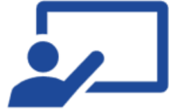
Paper Presentations by Researchers