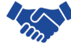
Industry EXPO for exhibiting new patents and industry solutions